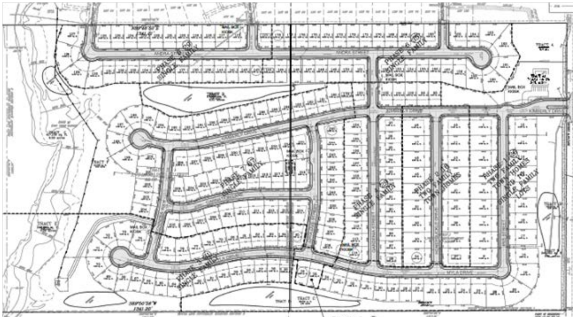
Proposed Lakeside Farms Conceptual Plan